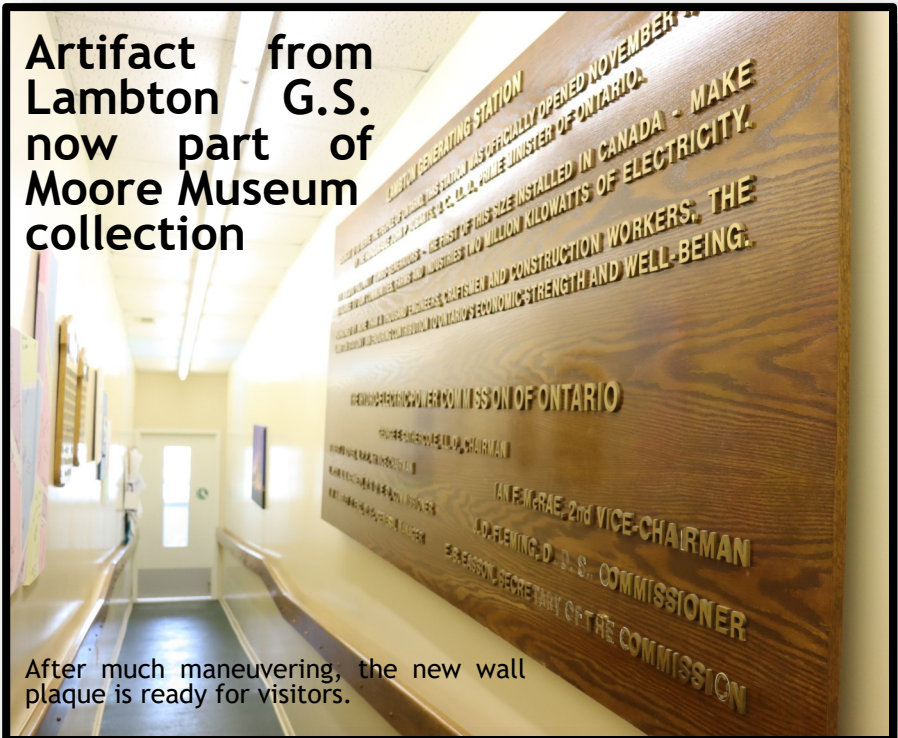
After much maneuvering, the new wall plaque is ready for visitors.