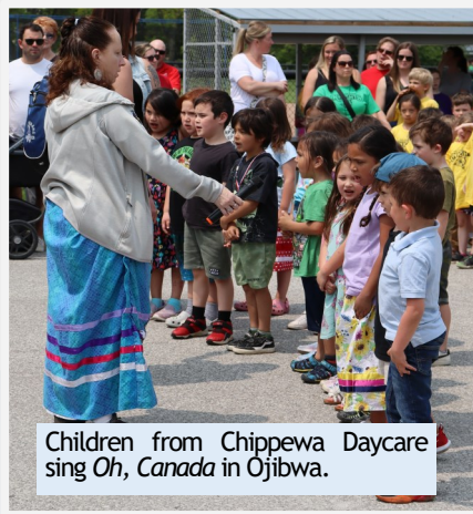
Children from Chippewa Daycare sing Oh, Canada in Ojibwa.