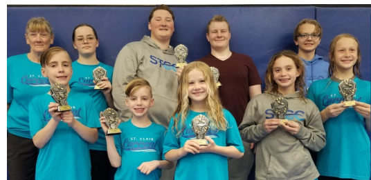
Top trophy winners pose for their Victory portrait.