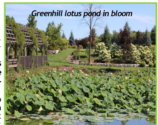
Greenhill lotus pond in bloom