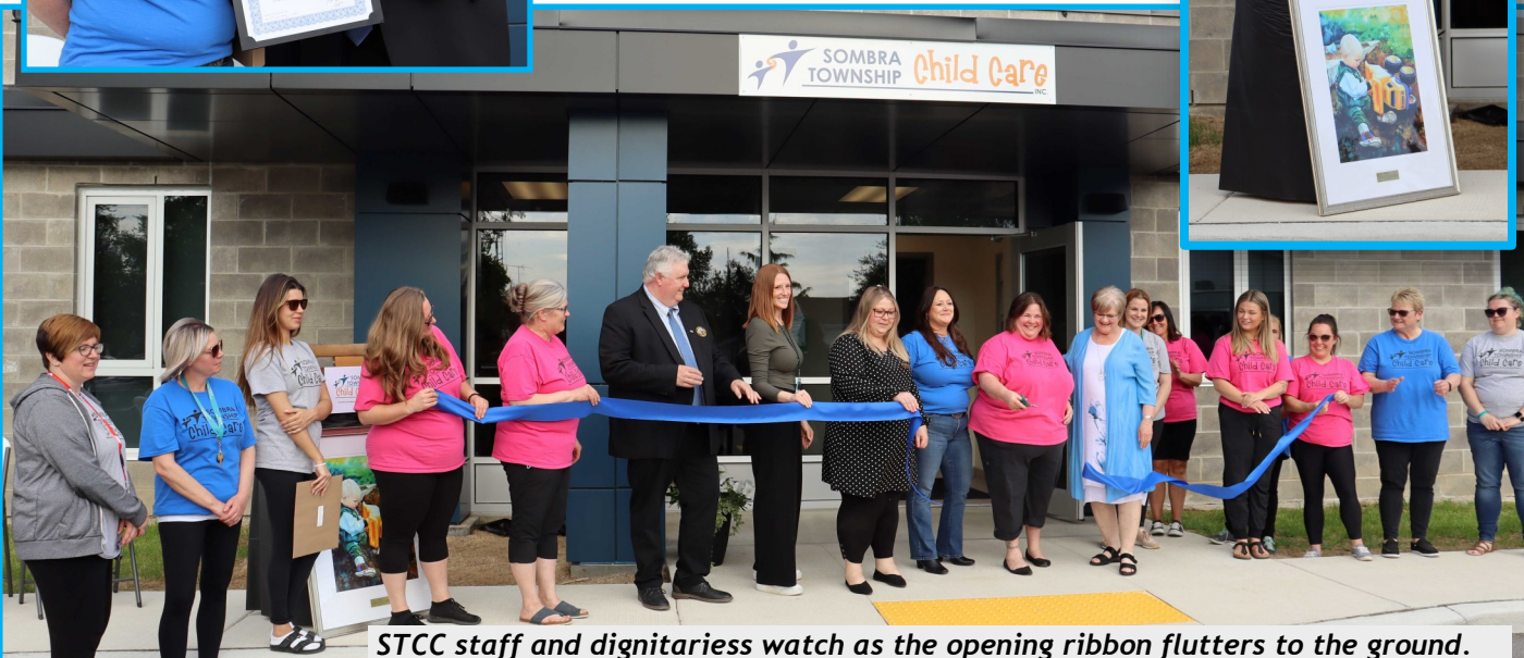
STCC staff and dignitaries watch as the opening ribbon flutters to the ground.